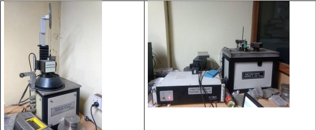
Ball-on Disc and Fretting Wear testing units (developed by Ducom) have been developed under the project sponsored by CSIR (as a PI) and installed in the wear testing laboratory of the Department.