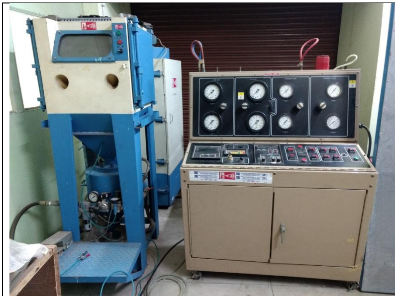
Sand Blasting Unit developed under the project sponsored by Department of Science and Technology, N. Delhi and installed in the thermal spraying laboratory

Thermal spray deposition is the versatile technique, which may be applied for the deposition of metallic, ceramic and also polymeric materials. However, a proper choice of spray torch is essential. With the aim to develop thermal spray deposition laboratory, a high velocity oxyfuel set up (for the development of metallic coating) and plasma spraying unit (for the development of metallic and ceramic coating) have been developed and installed. Funding from Naval Research Board and Department of Science and Technology are thankfully acknowledged. These facilities are installed in the Thermal Spraying Laboratory next to Steel Technology Center.